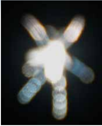
Picture 4: One fast moving orb, displaced over 50 times in discrete 'quantum' steps during the (1/1000 sec) photo exposure: such appearances, usually less distinct, are often mistaken as 'fairies'.