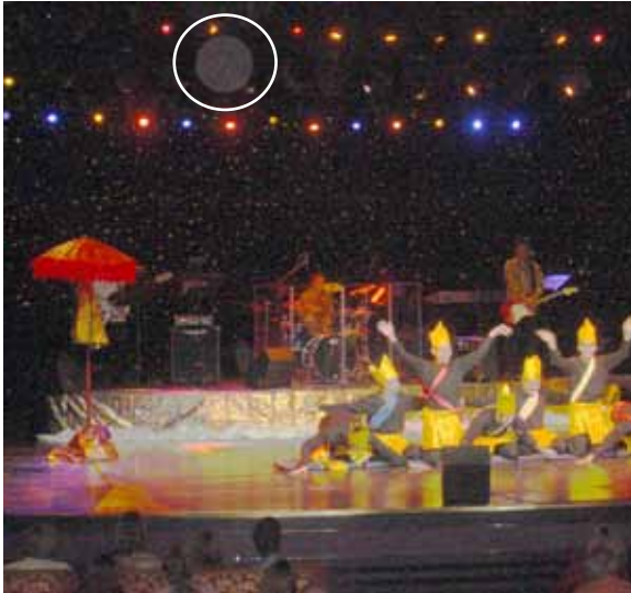
Picture 5: Theatre stage on a cruise ship, photographed in a telephoto camera mode; the orb has the same sharpness as the lights and mini-LEDs in the back-drop of the stage, evidencing that it was located near the stage and could not possibly have been close to the camera lens.