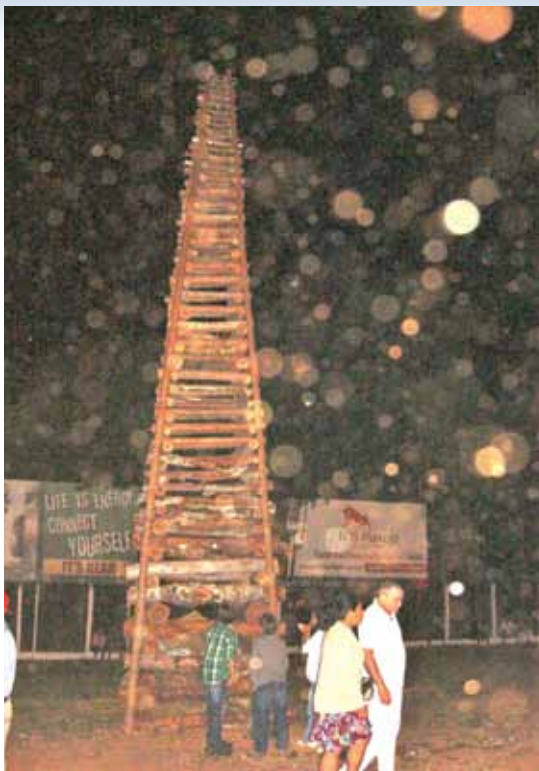
Picture 2 (right): During a celebration with Joao de Deus in Abadiania, Brazil: beings on the other side of reality are obviously enjoying the proceedings. (Every photo which we, and many others, took at this event, shows such multitudes of orbs).