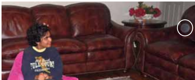
Picture 8: The same child, looking at the orb.