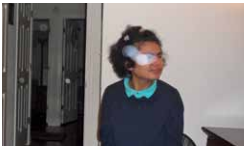
Picture 7: A fast-moving beam of Light, indicating to a mentally challenged child that help from beyond is active. (Photo courtesy of M.R. Ansari).