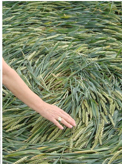
Photo: Walking in a crop circle. Note the precise delineation of fallen and standing grains (left); and note the whirlwind-like nodal points and kinking pattern.

How can we begin to cover these four major crop circle characteristics with a plausible explanation? We have argued that Orbs are imprinted on digital photo charge plates by non-human intelligent entities that have the ability of “producing” subtle energies in the order of 10-16 ampere-seconds and directing those as seems fit. Might it be conceivable that these same non-human intelligent entities are capable of directing these minute energies to the precise biological cells at the nodes of the stems and alter the programming of these cells locally such that these grains physically weaken and bend precisely at the intended locations, in just perfect directionality? Location and