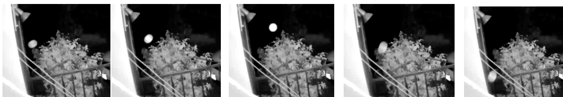
Photos above: Series recorded with a security camera at our house. Each picture represents one half-frame (1/60 th of a second) from that movie clip, in about 1-second intervals. It is apparent that during this short time the orb never moved in a continuous motion but rather always in a quantum step-wise fashion. (12/5/2016).

In numerous cases, surveillance recordings were triggered by no other motion than that of an orb-like phenomenon. An example is shown below. Within a recording of a few seconds, the orb was moving seemingly erratically in various directions throughout the entire field of view, back and forth and up and down. We have shown five of the multitudes of momentary locations of the orb, which moved in Quantum-step displacements.